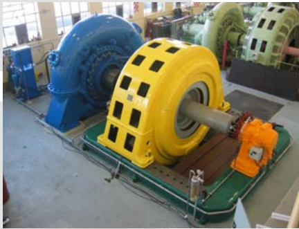
Left: G8 after completion of refurbishment.

The turbine was recommissioned after installation and alignment of the refurbished parts.