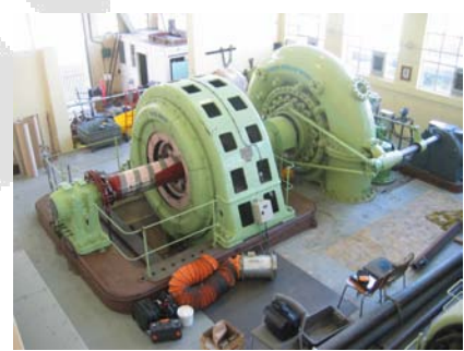
Below: The adjacent G9 turbine in its original condition.