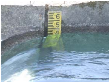
G8 weir level at 3,000 kW

G8, the first of the two turbines, was returned to service in March 2008.