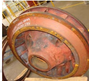
Original cast steel runner