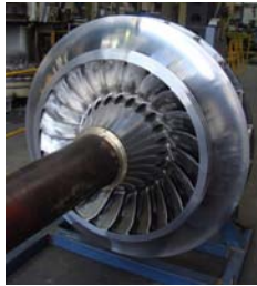
Redesigned martensitic stainless steel runner.

TrustPower Ltd then stripped the turbine and sent it to Mace Engineering for refurbishment.