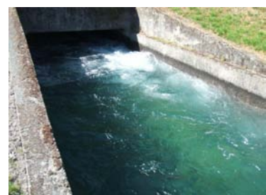
G9 tailrace at 3,000 kW

The tailrace of G8 shows significantly less turbulence and a lower weir level (4.0 and steady versus 4.4 and fluctuating between 4.0 and 5.0). The difference in weir heights equates to a reduction in flow of 12% at the same power output.