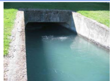
G8 tailrace at 3,000 kW

The top photos show the tailrace of G8 after refurbishment and the bottom photos show the identical G9 unit which is yet to be refurbished. Both units are at the same power output of 3,000 kW.