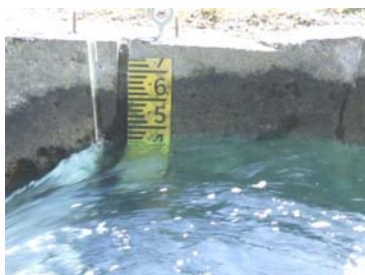
G9 weir level at 3,000 kW

The tailrace of G8 shows significantly less turbulence and a lower weir level (4.0 and steady versus 4.4 and fluctuating between 4.0 and 5.0). The difference in weir heights equates to a reduction in flow of 12% at the same power output.